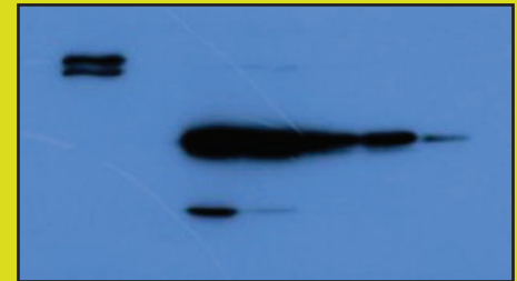
Western Blot showing successful expression of IL-1ra in Carrot cells using the pMJ2 plant expression vector.

Based on the GC-rich mechanism, we are now developing super-expression technology for the future development of molecular farming for pharmaceutical and biofuel production.